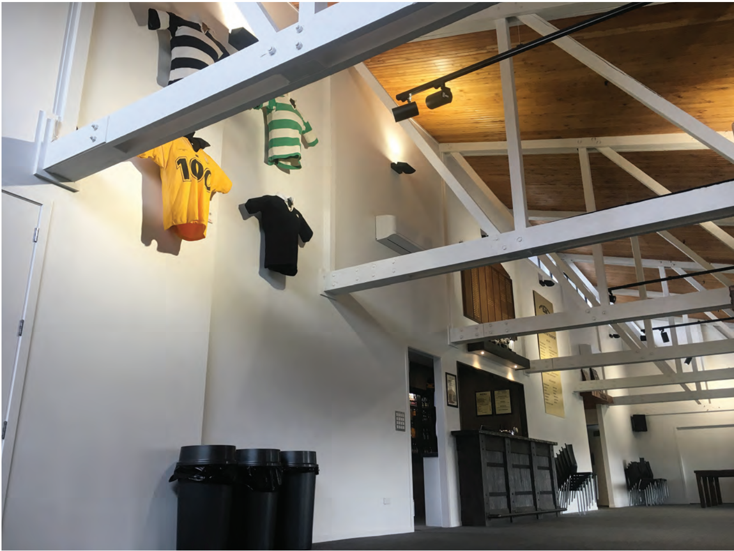
The rebuild includes two new changing rooms, equipment storage rooms, new toilets and shower blocks, meeting room, and a 50sqm extension of the main social area.

The $1 million project could not have been achieved without the support of sponsors such as Upper Clutha Transport, and various local builders