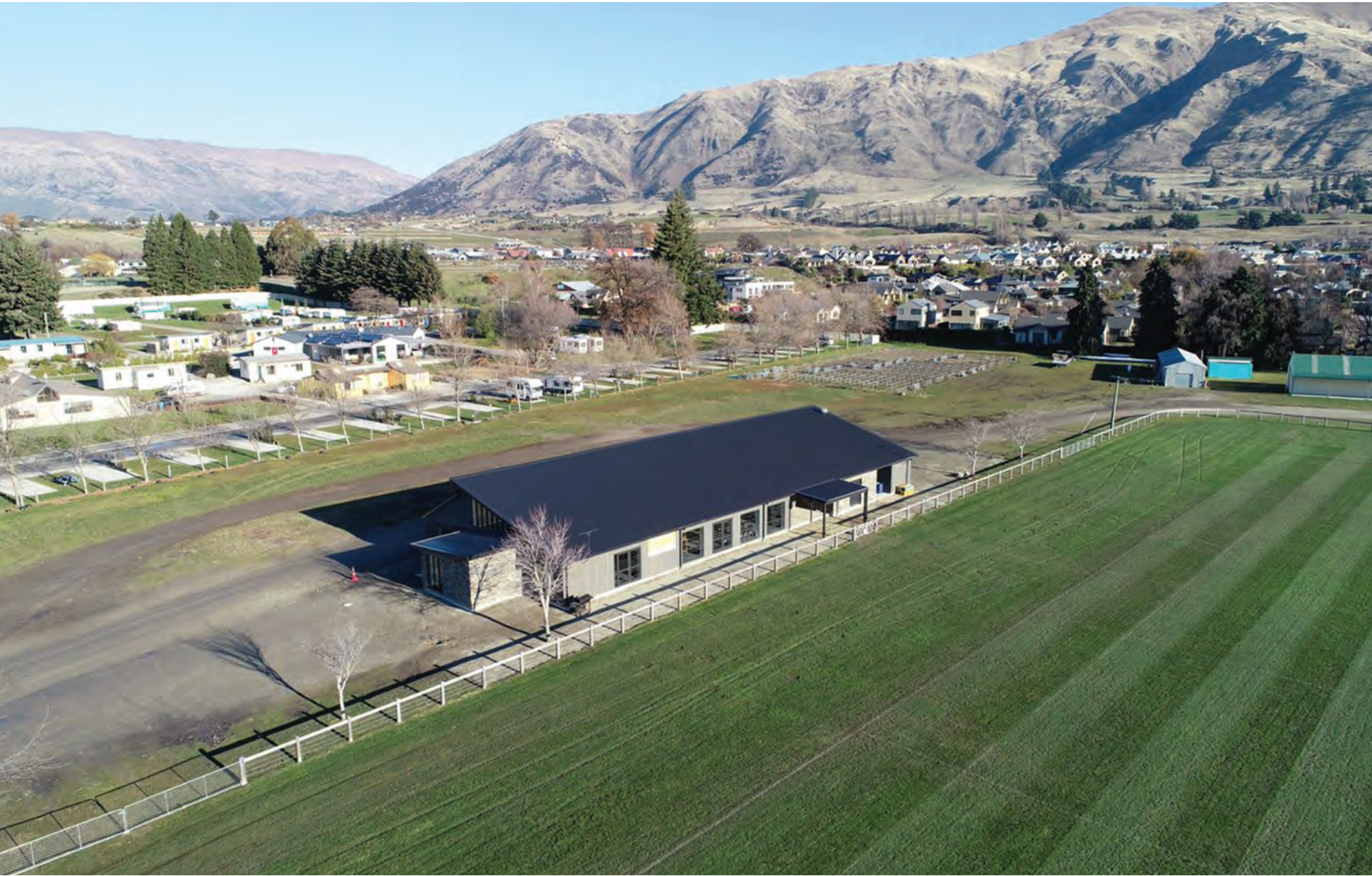
Ready to go: the Upper Clutha Rugby Club's stylishly redeveloped clubrooms at the Wanaka A&P showgrounds.